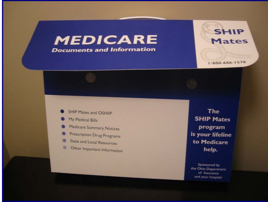
Front of SHIP Mates Resource Kit

Created by the Ohio Senior Health Insurance Information Program (OSHIIP)